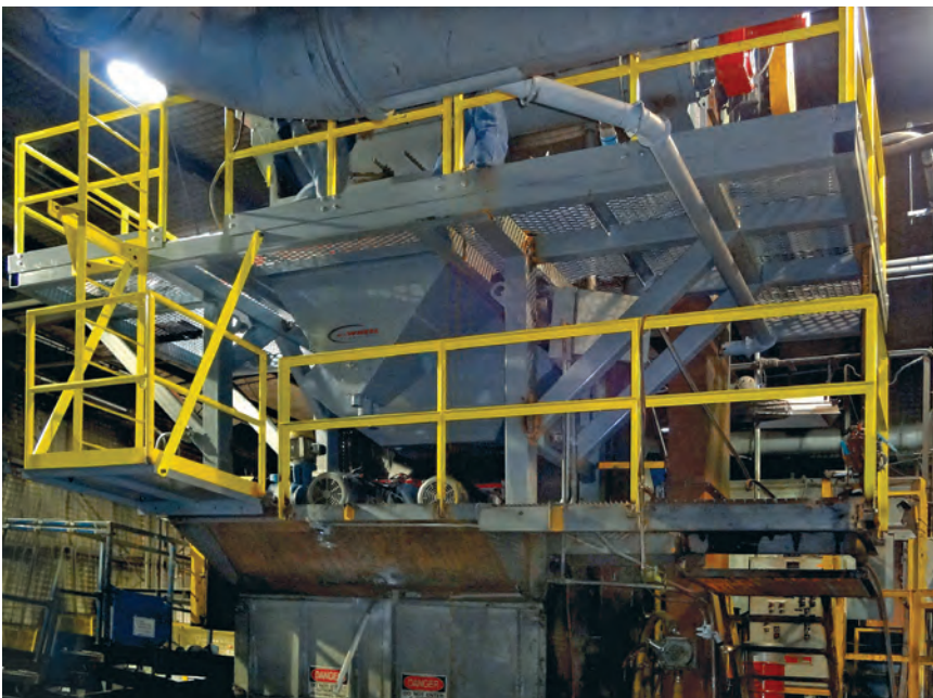
Rochester Metal Products wanted improved performance from its 34-cu.-ft. tumble blast unit.